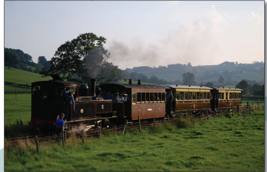
Early evening arrivals at the halt can benefit from some wonderful light from the descending sun. Here the driver is handing the single line staff to the volunteer signalman.