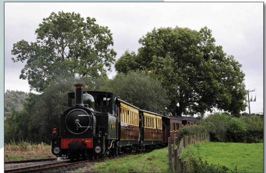
'The Countess' arrives at Cyfrnydd Station.