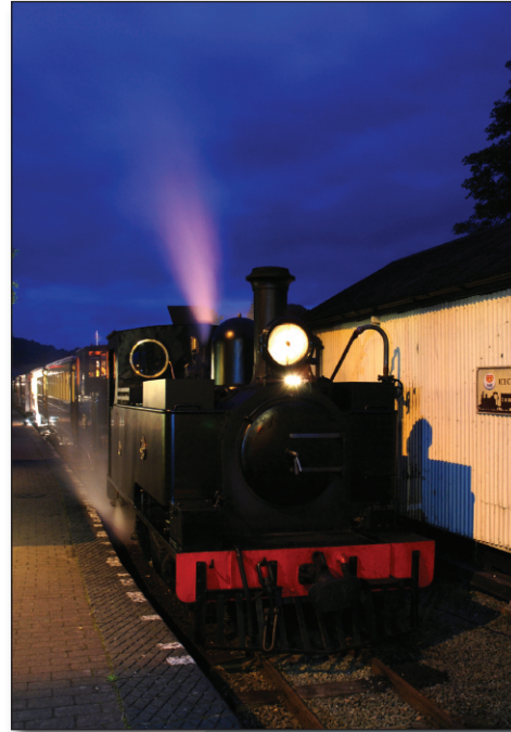
No. 14 has advanced along the headshunt to take water.