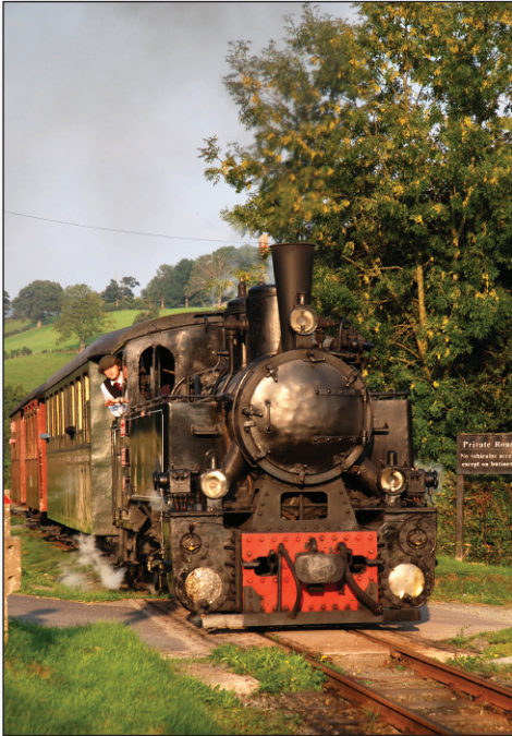
No. 19 'Resita 764-425' crosses over New Drive and heads for the setting sun.